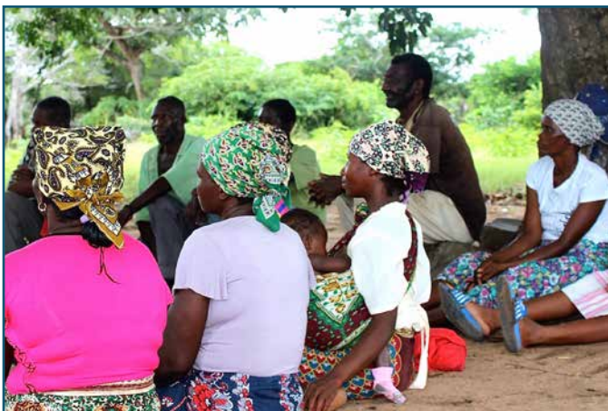
Female members of the Community Land Committee in Coguno.

CTV uses participatory discussions and community members’ own experiences, interests and ideas to address intra-community discrimination. CTV’s approach helps deepen community members’ awareness and appreciation of the positive benefits of women’s land tenure security. In response,