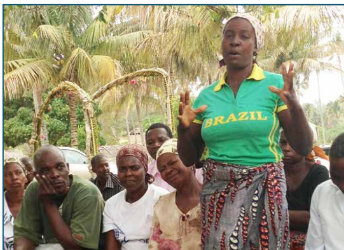
Women actively participated in community by-law meetings in Mata.

While investigating the reasons for the weak enforcement of women's land rights, CTV identified a critical gap in the rule-drafting process: the Customary Tribunals ( Tribunais Costumarios ) were not adequately involved in the rule-drafting process. The Tribunals are the customary dispute resolution forum. Because CTV had inadequately involved the Tribunals in the discussion and adoption of the community's rules, the Customary Tribunals were continuing to use the 'old' rules, rather than the new norms agreed by the community after months of participatory discussion and revision. Because they did not incorporate the new rules into their decisions or punish people who violated them, the Customary Tribunal's decisions were seriously undermining the effectiveness and perceived legitimacy of the new rules.