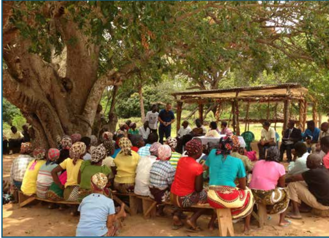
A community meeting in Mata about drafting community by-laws.