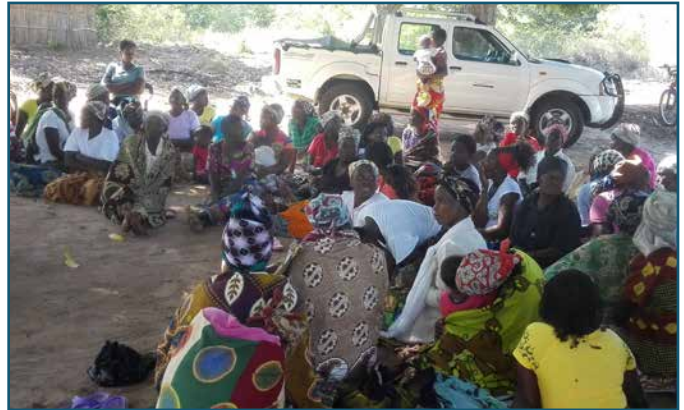
Women of all ages participate in a women's meeting on by-laws in Ngulela, Inharrime District.

To ensure that all people in the community feel comfortable expressing their opinions, CTV holds separate sessions with groups of women, men and leaders. CTV's field staff facilitate each group to ensure that discussion covers the full range of community rules, norms and practices,