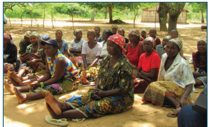
Women attend a community land meeting in Inhambane.

Under Mozambique’s Constitution and Land Law (1997), communities may legally govern their lands and natural resources according to customary norms and practices, so long as local customs do not contradict national law. However, rising land scarcity and associated increases in land value are leading some families to “reinterpret” custom as sanctioning the dispossession of widows from their marital lands. This Lesson from the Field describes how Centro Terra Viva (CTV) and Namati support communities to strengthen women’s land rights within customary systems and harmonize local practices with national and human rights law. The publication also describes CTV’s efforts to involve Customary Tribunals and local dispute-resolution authorities in efforts to ensure the implementation and enforcement of community rules designed to protect women’s land rights.