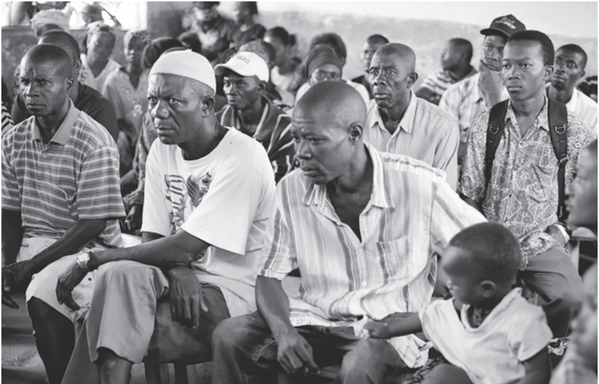
Community members participate in a community rights meeting organised by paralegals in the village school.

Under this agreement, the entire land area of Masethele (2,796 acres) was leased out to Addax. Although Addax intended to use only one-fourth to one-third of the village's land, the lease gave them control over all of it in case they wanted to expand, including farmland, common areas, forests, wetlands, water bodies, and even house plots. This threatened to dispossess the whole village of the lands and natural resources central to the villagers' livelihoods and identity. When the villagers learned of the land deal, they refused to acknowledge the lease as they were dissatisfied with both the substance of the lease and the lack of proper consultation. Despite pressure from the chiefdom council, district council and parliamentarians, the community members refused to accept their allotted share of the rent paid by Addax. According to one inhabitant, "The council should have asked us if we wanted to lease our entire village to Addax, but they didn't and we actually don't want to give all our land to Addax." However, Addax insisted on its right to the entire area under the lease agreement. The resistance to renegotiate and Masethele's collective resolve to protect their lands led to an impasse for over 2 years.