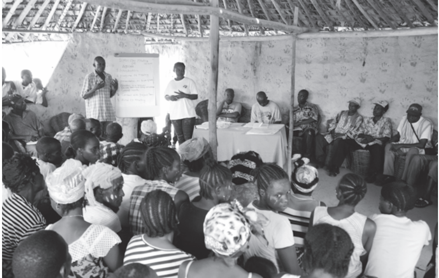
Community mobilizers facilitate a community land protection meeting in Rivercess county.

that lives there and its customary legitimacy relies upon its ties to a town. As villages grow, they may demand town status, along with increased customary privileges and responsibilities. There is often considerable political wrangling concerning the formation of villages and towns: denial or delay of a request to become a town may cause a village to ally itself with a different town, or even a different Clan. Some villages try to secure private land rights in order to become private family estates.