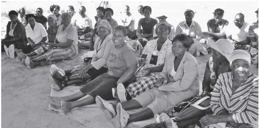
Women from Marange and Arda Transau meet with CCDT to develop strategies for increasing women's roles in community decision-making.