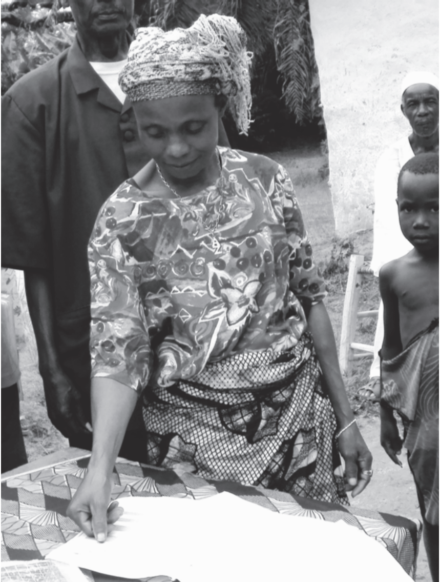
A woman signs her community's boundary harmonization MOU, Rivercess county.