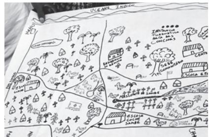
Left: CTV staff and community members document disagreements about boundary locations.