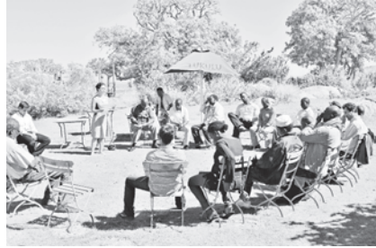
Participants at the 2013 Symposium in South Africa.