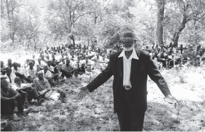
Community leader in Marange describes the negative impacts of diamond mining and forced evictions that his community has experienced.

was at risk. In addition, once relocated, some community members lost livestock when they failed to adjust to the new environment. Some of the relocated community members also lost livelihoods as they had been primarily engaged in farming on lands that they now could not access.