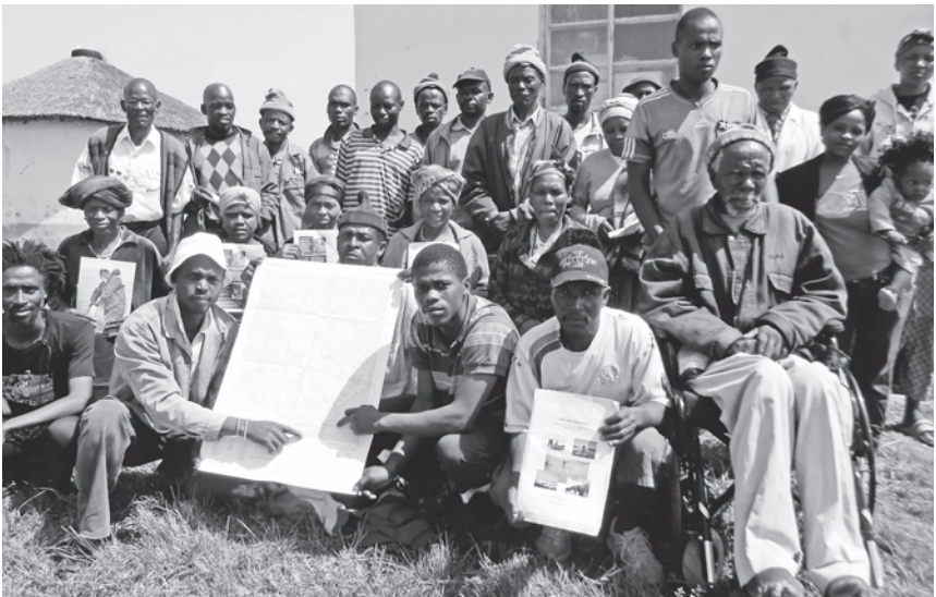
Hobeni community participants showcase materials produced with LRC as part of their legal case.

Similarly, at another meeting some months later, the LRC pushed the fishers for an explanation of community sanctions when community rules are broken. The purpose was to demonstrate the existence of a governance system and the logic of sanction was integral to it. Every time lawyers asked what would happen if someone broke a rule, for example, by catching more fish than he could carry, the fishers responded by saying that that would not happen. Again they would ask, “Ok, but let us pretend that someone had broken a rule. What would happen to that person?” “It wouldn't happen”, they responded. It was not even possible for them to imagine.