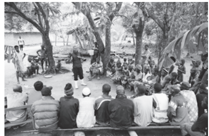
Left: A mobile irrigation system lines a road running through land in Masethele cleared by Addax Bioenergy to produce sugarcane and biofuel for export.