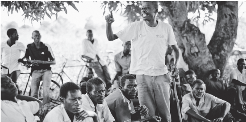
Discussion about land disputes can escalate quickly in community meetings.