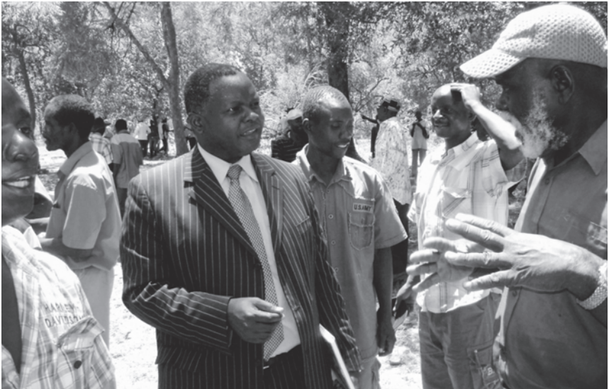
ZELA staff members listen to Marange communities on a tour of the negative impacts their community has experienced from diamond mining on their lands.

While ZELA counts this case as a success, the organization recognizes that justice for the relocated community members has still not been fully realized. The schools that were built in the relocation area do not fully accommodate all children and most of the relocated families have yet to receive compensation. ZELA has therefore learnt the importance of sustaining its advocacy and litigation efforts to ensure the full protection and realization of community rights in the face of corporate and state projects.