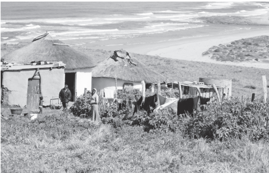
LRC works with many remote and rural communities across South Africa that were concerned about the proposed traditional courts bill.

It thus came as no surprise that the few rural communities who came to know of the Bill rejected it outright. Women’s groups in particular voiced their deep concern with the Bill’s lukewarm response to the very real discrimination against women in many existing traditional courts. In addition, some constitutional lawyers and activists bemoaned the fact that the Bill made no attempt to reflect the law as actually practiced on the ground (such as strong, bottom-up customary accountability mechanisms, rather than the exclusively top-down mechanisms set out in the Bill). Traditional leaders, on the other hand, made no secret of their reasons for supporting the Bill: without this law, they argued, they had no power over their communities and thus could not perform their “functions.”