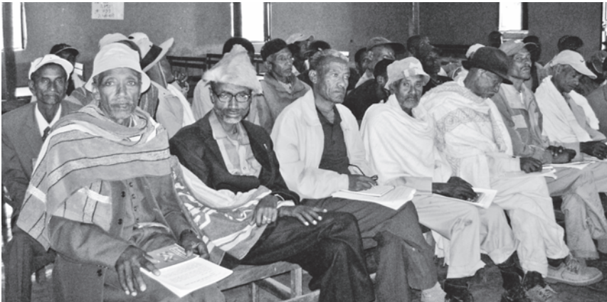
Sheka community leaders assemble for a capacity-building meeting with MELCA.