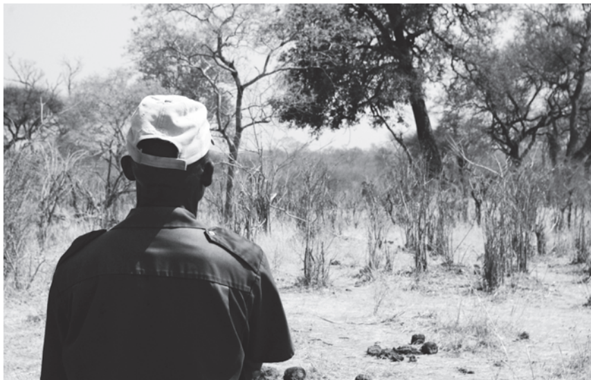
A TEKOA guide from the Khwe San community leads a trek through Bwabwata National Park.