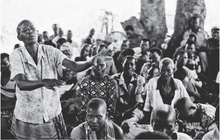
A woman explains the importance of guarding against future encroachments on her community's common land.

2. Opportunistic: These individuals take advantage of a lack of strong management structures for the common land. Weak land governance and leadership often mean that there are no punitive consequences for appropriating community lands in bad faith, so opportunistic individuals may “try their luck” by moving onto the community land and waiting to see what happens. In most cases, these people are following the example of “ringleader” encroachers and, when questioned or challenged, assert that they will only leave the land when the lead perpetrator leaves. If confronted, they may either abandon or intensify their encroachment.