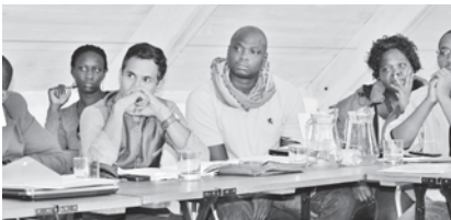
Symposium participants shared and brainstormed numerous strategies for supporting more accountable local governance of land and resources in Africa.