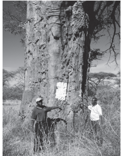
Left: Hadza men prepare traditional hunting equipment during a cultural event.