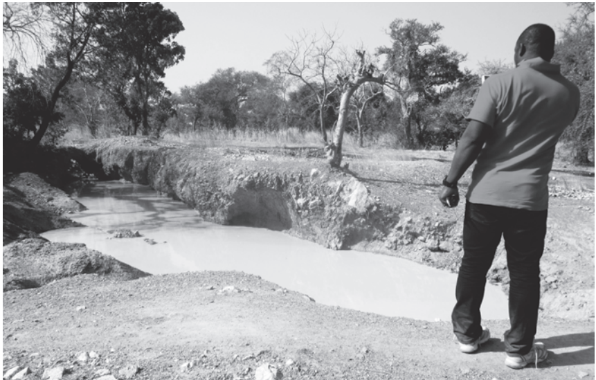
A CIKOD staff member visits one of many pits created by uncontrolled, artisanal mining in Tanchara's community lands.

When CIKOD began working with the Tanchara community in 2003, the goal of the community and its traditional leaders was to strengthen their capacity to respond to the challenges created by mining activity in the region, and to do so using the community's own internal resources. As in many countries around the world, engagements between mining companies and communities in Ghana are often unequal. Oftentimes mining companies will only engage with government officials, excluding communities and their indigenous institutions. Over the last 11 years, the government of Ghana has continued to allocate foreign mining companies licences to prospect for gold in the Upper West Region of the country without the knowledge of, consultation with, or consent by local communities who have traditionally owned, occupied, and used these lands. The situation in Tanchara was no different: In 2004, the Ghanaian government granted the Australian mining company Azumah Resources Limited (Azumah) rights to prospect for gold in Tanchara, in the Upper West Region of Ghana, without consultation with - or consent by - the communities in the area. The grant of prospecting rights caused an influx of illegal miners into the area, whose activities then resulted in water pollution, partial destruction of some of the community's sacred groves, and the creation of large, uncovered pits that caused deaths in the community.