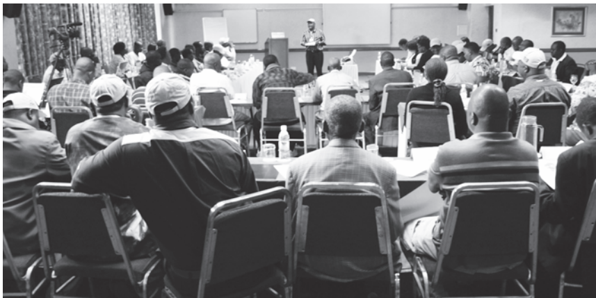
Marange community members and ZELA present concerns about diamond mining activities and relocations to the government.

It is also important to ensure that the work is grounded in the local community. Research, advocacy and litigation efforts that are totally divorced from the actual community members do not galvanize the community and are not sustainable. In Marange, ZELA worked towards its own obsolescence by building up a cadre of community activists who took the lead on resisting relocation and holding the government to account.