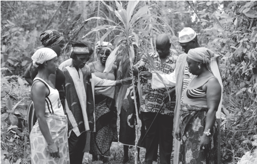
Members of the Sihan Clan Land Governance Council plant boundary marker trees along their agreed boundary, Rivercess county.

In 2013, Liberia passed a new policy to protect customary community land claims, which has encouraged communities to demarcate their land claims. However, the social upheaval and displacement experienced by current generations during the civil wars, as well as the loss of community elders and leaders, means that the process of agreeing upon the boundaries of community lands is often fraught with conflict. As such, much of SDI's work on community land protection focuses on conflict resolution and the harmonization of boundaries between communities.