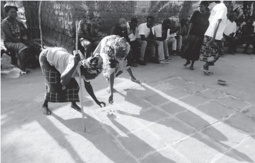
Women in Ibefo begin work on a resource map of their community.

As the Village Action Plan is implemented, there is an annual or mid-term evaluation phase, during which ADHD staff and Ibefo's community members assess progress made on the implementation of the activities identified. In Ibefo, evaluation meetings are held on the 15th of August every year. A final evaluation meeting will also be held at the end of the Village Action Plan's implementation. These evaluations identify what plans and work were completed, what efforts worked well, what efforts did not work well and why, and how to improve future efforts.