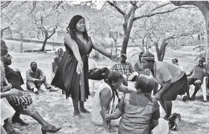
CCDT leads an interactive discussion about women's rights with community members.

Particularly when working with women, CCDT sees it as crucial to involve women directly in identifying the challenges they are facing, defining those issues, and coming up with an intervention strategy. This empowers women to actively participate in decisions that affect their lives and well-being. Organizations and advocates can support women's efforts to identify and articulate their concerns and ideas by providing equal access to information, training women in participatory research methods, and supporting women to contribute their voices and perspectives directly into community dialogues and any media or other materials that the community or organization produces.