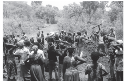
Left: Ibefo community members on a community hillside reforestation project.