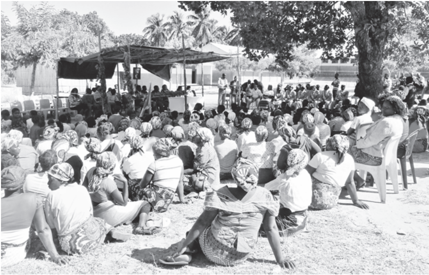
Community meeting in Marrúcuá to discuss boundary harmonization.

This is the challenge faced by the community of Marrúcuá. For years, the community has been unable to secure legal protections for its customary lands because its self-defined boundaries span an administrative border: the line between the Morrumbene District and the Massinga District. According to the traditional authorities of Marrúcuá and Muhaque (the community with which Marrúcuá shares the contested boundary), the boundaries between the two communities never coincided with the administrative boundary between the two districts. Despite the District boundary that runs through Marrúcuá's lands, the community members of Marrúcuá have always identified as one, united community. However, District officials of Massinga and Morrumbene Districts have refused to endorse changing the official boundaries between the two communities. Instead, they insist that the traditional limits coincide with the administrative boundary between Massinga and Morrumbene Districts.