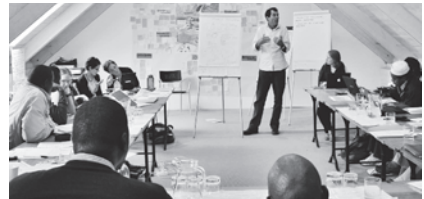
Symposium participants presented on their experiences and strategies to challenge state-sanctioned displacement of communities.