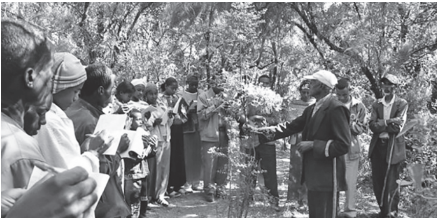
MELCA and community members lead an environmental education session in the Sheka forest.

On 11 July 2012, UNESCO added the Sheka Forest Biosphere Reserve to its global list of 599 Biosphere Reserves in 117 countries. Now the entire Sheka Zone is divided into a “Core Area,” which consists of dense forest and is totally reserved for conservation; a “Buffer Zone,” which surrounds the core zone and allows certain activities which have no negative effects; and a “Transitional Area,” in which development activities including environmentally friendly investments are allowed. As further support, the SNNPR State has also issued the “Sheka Zone Protected Forest Development, Conservation and Utilization Regulation” for enforcement of the demarcations and principles of UNESCO for Biosphere Reserves.