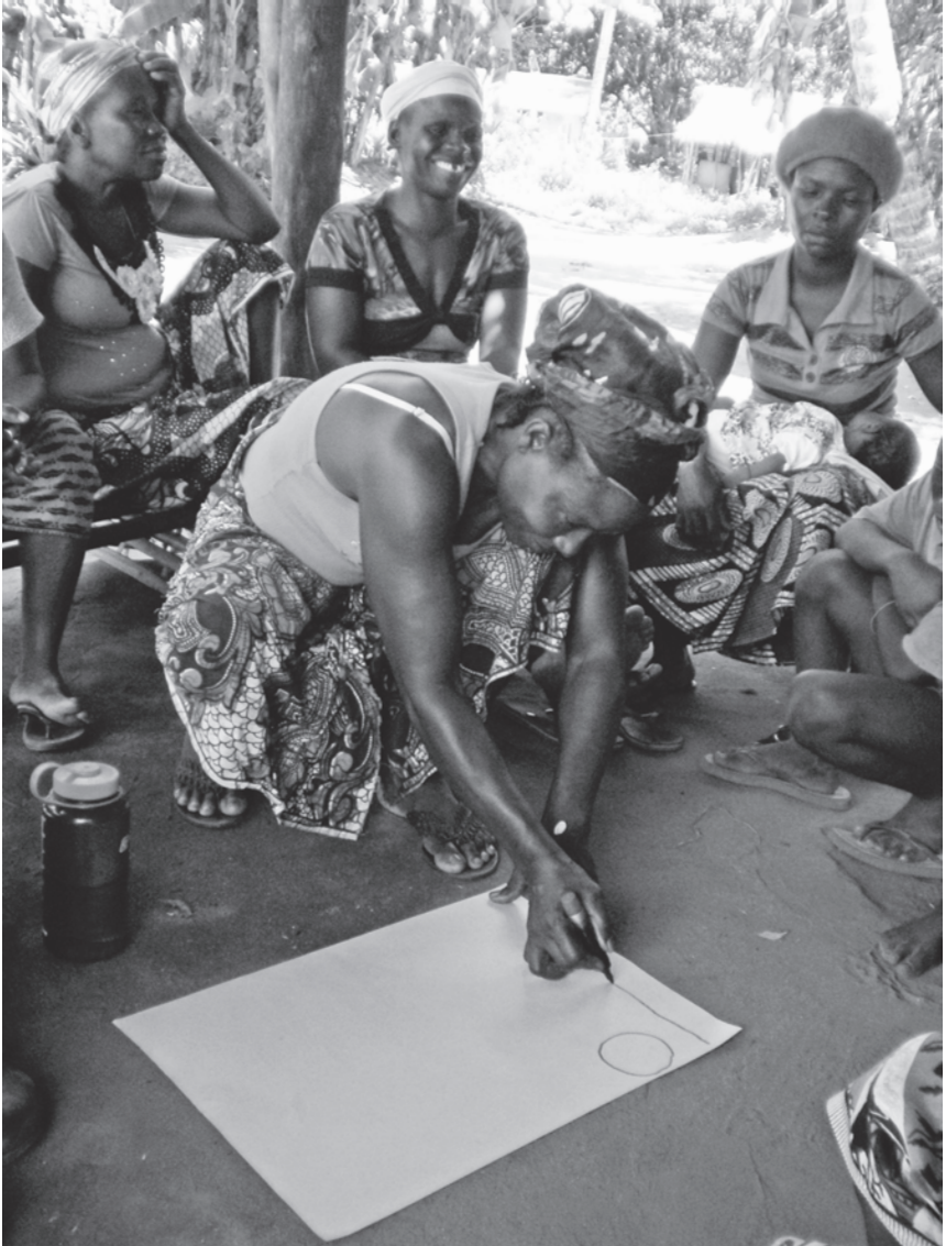
Women in Rivercess complete a sketch-map of their community lands.