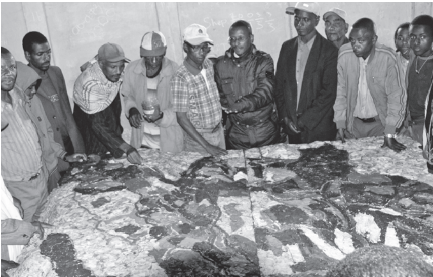
Community members make a 3-D map of their territory in the Sheka forest.

Hence the processes enabled the community to see and realize what they currently had, and what they have lost in cultural and natural resources as well as traditional ecological knowledge. Realizing the situation inspired them to take measures to curb the adverse situation that they or their children are going to face.