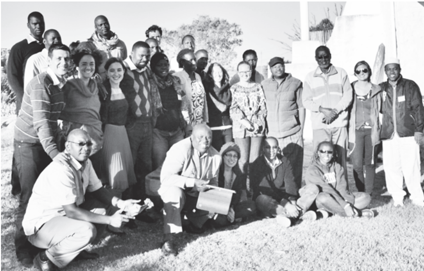
2013 Symposium participants.

The struggles and victories of an individual organization or community can at times feel overshadowed by influential opponents and daunting global trends. But when taken together, individual stories of creativity, unity, courage, and solidarity coalesce into their own trend - a stirring, alternative narrative of hope, justice, and the power of collective action.