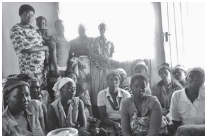
Women from Marange gather to discuss and document the negative impacts of mining that they have experienced.

In addition to its community work, CCDT advocates for women's rights more broadly. For example, CCDT advocates that women's rights to inheritance and ownership of land and property should be recognized and calls for social reforms to end discrimination against women in Zimbabwe. In particular, CCDT calls on the government to take an active role in social reforms by acknowledging women as partners in development by ensuring their involvement in law-making, policy-making and decision-making processes. Finally, CCDT advocates that governments require all investors carry out Gender Impact Assessments (GIAs) before mining commences in order to ensure that gender issues are considered in the planning and implementation of all mining projects and to mitigate the negative impacts of mining on women's lives and well-being.