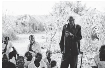
Left: LEMU supports communities to document, debate, and agree on community land management rules to protect their natural resources and avoid land conflicts.