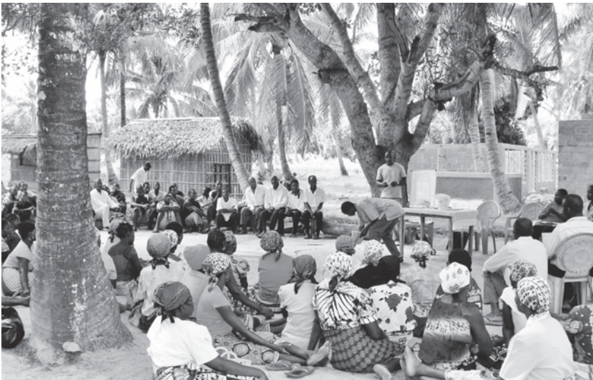
CTV facilitates large, participatory meetings during the community land protection process.