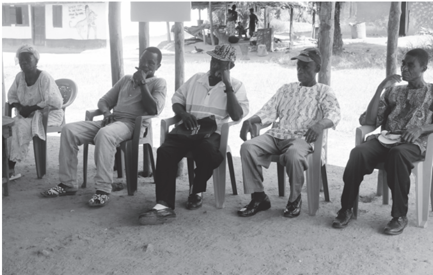
The leaders of Duah listen to the concerns and suggestions of community members.

Positively – and perhaps because of the Lion Limited Ltd. scandal, the Land Governance Council of Duah clan is now functioning smoothly and no new land disputes or attempted land transactions have been reported to SDI. Overall, it seems that Duah's experience strengthened and further legitimized the new Land Governance Council and community by-laws.