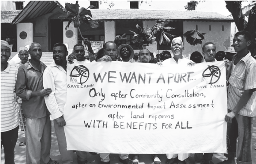
Save Lamu with community members protesting about the port development in 2011.

Advocating for community rights in these circumstances draws much negative attention to Save Lamu's work. Save Lamu is often described as anti-development, which in this context has connotations of being anti-government. Indeed, only after the promulgation of the new Constitution and its devolved system of governance which established the county system of government, was Save Lamu able to engage in meaningful dialogue with local government officials. The new county government acknowledges Save Lamu and has legitimized its work to defend community rights, county rights, and land rights as being not contrary to development. The county government's position has always been that consultation and free prior and informed consent should be engaged in with all communities hosting development projects.