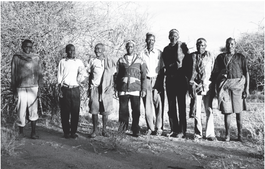
Hadza community members take UCRT staff members out on the land to demonstrate and document their traditional knowledge of the landscape.

Tanzania began a process of land reform in the 1990s to address some of these issues. The Village Land Act of 1999 was intended to delegate land control to local communities through the establishment of village councils and land use plans. However, while the Act dealt extensively with the land rights of Tanzania's numerous agricultural and pastoralist groups, the rights of hunter-gatherers were not mentioned. Additionally, there has been no mention of hunter-gatherer communities in any contemporary Tanzanian law. This has created obstacles in trying to assist these communities to define and secure their rights over those of dominant neighboring tribes. Moreover, later legislation such as the Wildlife Conservation Act of 2009 threatens the very survival of the hunter-gatherer community by criminalizing hunting without a license.